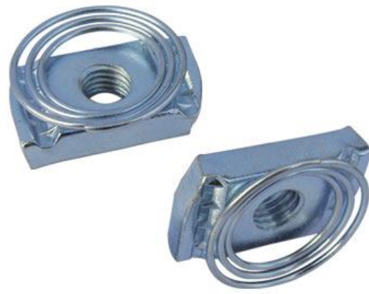
Top Spring Channel Nut